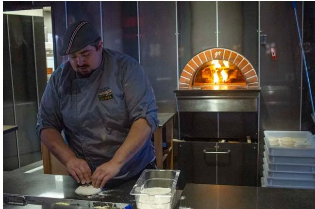
Image: Maggie's Farm Wood-fired Pizza. 1308 Melrose Ave., Iowa City.