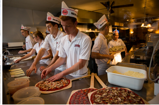
Image: Pagliai's Pizza. 302 E Bloomington St., Iowa City.